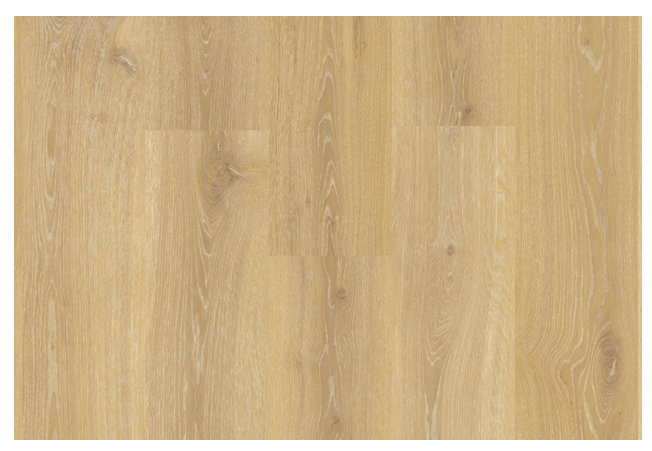
Tennessee Oak Natural