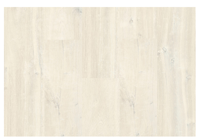
Charlotte Oak White

Note: Brochure swatches are indicative only, and colours may differ on digital devices. Please contact our Floorboards team to arrange to see larger flooring samples or visit our showroom.