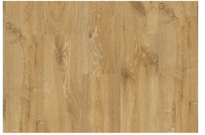
Louisiana Oak Natural