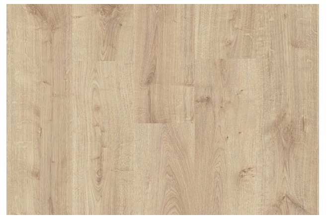
Virginia Oak Natural

Enjoy the beauty of an oak look with the contemporary Creo laminate floor range. At 7mm thick, this European laminate combines high scratch resistance with a waterproof surface, making it ideal for wet areas such as kitchens and bathrooms. Transform your home with a matt-finished floor in a seamless grooveless design at an affordable price.