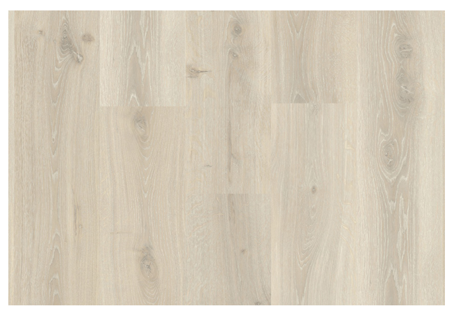
Tennessee Oak Grey