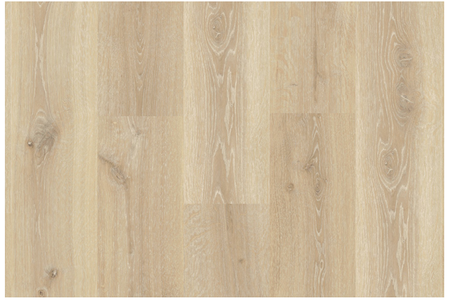
Tennessee Oak Light Wood